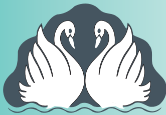
WALT DISNEY WORLD SWAN